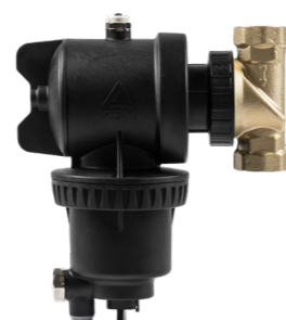
MP2 Series 3833 Measures: 1"