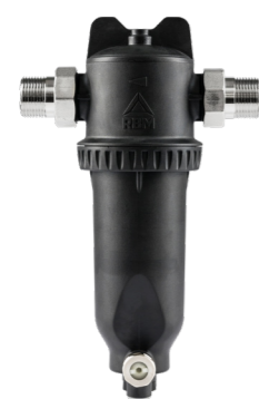
MP1 Series 3699 Measures: 1" - 1"1/4